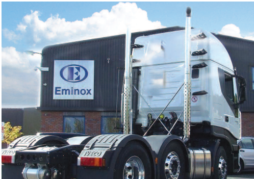
Twin tailpipe conversion on Iveco 480 Euro 5