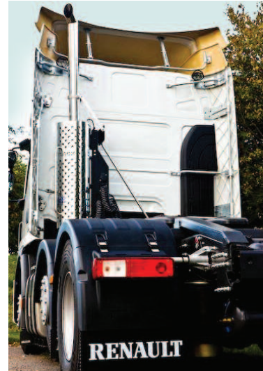
Single stack conversion on Renault Premium Euro 5

Eminorx specialises in the design and manufacture of exhaust systems for both original equipment manufacturers and retrofit applications. We have extensive knowledge of the latest emissions reduction technologies such as SCR and EGR. We have been producing and fitting exhaust conversions since 1978, including the iconic Eminorx stack. This combination of experience means we have the expert knowledge required to carry out the complex conversions for Euro 4 and 5 vehicles.