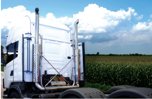
Twin stack conversion on Scania R620 Euro 4