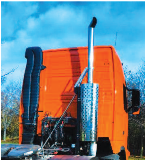
Single stack conversion on Volvo FH13 Euro 5