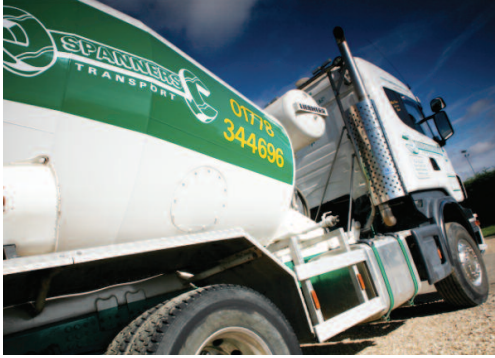
Single stack conversion on Scania R340 Euro 4