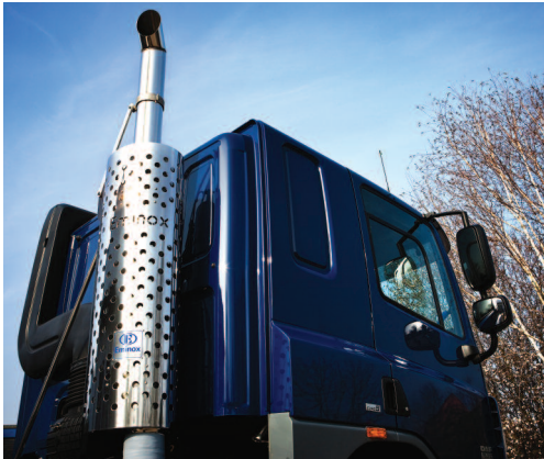
Single stack conversion on DAF 75.310 Euro 5